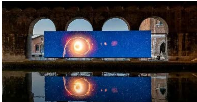
Figure 1. Global New Media Art Installation.

By engaging audiences in these conversations through interactive and immersive experiences, New Media Art can raise awareness and inspire action on important social and political issues. Furthermore, New Media Art has influenced other cultural sectors, such as music, fashion, and advertising, where digital aesthetics and interactivity are increasingly valued. The integration of New Media Art principles into these fields has led to innovative approaches and has expanded the reach and impact of art beyond the gallery walls. As shown in Figure 1, Global New Media Art Installation, these installations often create immersive experiences that engage viewers in new and dynamic ways. Similarly, Figure 2, The Era Art Museum presents a new media art installation with light as the theme in its dual exhibitions, exemplifies how New Media Art installations can integrate technological and aesthetic elements to push the boundaries of traditional art spaces. In summary, the cultural impact of New Media Art is multifaceted, affecting how we create, distribute, and engage with art. It has democratized access to art, challenged traditional art forms, and fostered social and political dialogue. As technology continues to evolve, the cultural impact of New Media Art is likely to grow, shaping our understanding of art and its role in society, as illustrated by this picture [10].